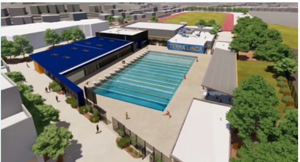
Terra Linda High School

Temp Housing (Dawg Town) at Soccer Field