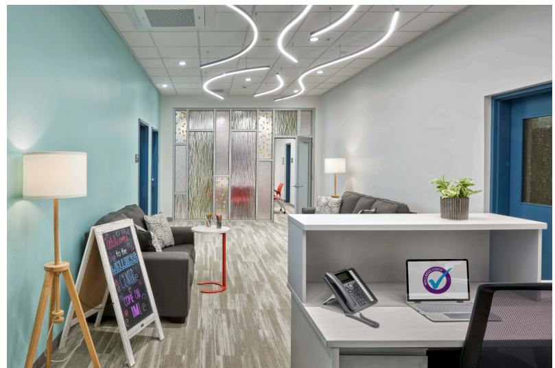
San Rafael High School Wellness Center Lobby