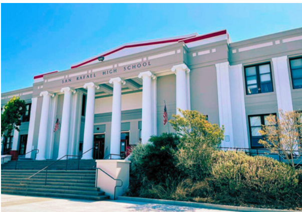
San Rafael High School Painting & Exterior Repairs

San Rafael High School Painting and Exterior Repairs