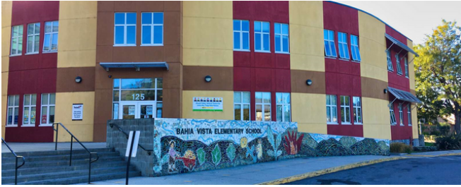
Bahia Vista Elementary School Re-Roofing

Bahia Vista Elementary School Re-roofing of Buildings A, B, and C Completed 10/10/2022 Square Footage: 20,000