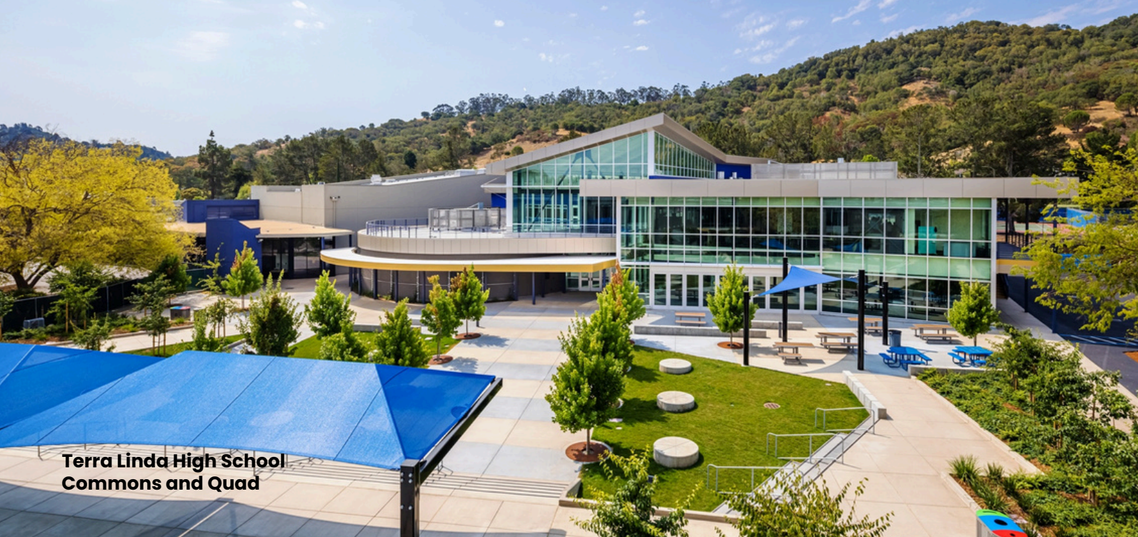
Terra Linda High School Commons and Quad