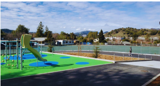
Venetia Valley K-8 School Field Restoration

Bahia Vista Elementary School Re-roofing of Buildings A, B, and C Completed 10/10/2022 Square Footage: 20,000