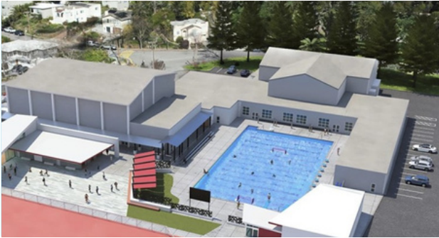
San Rafael High School