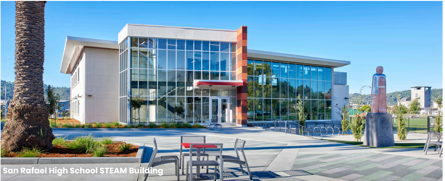
San Rafael High School STEAM Building