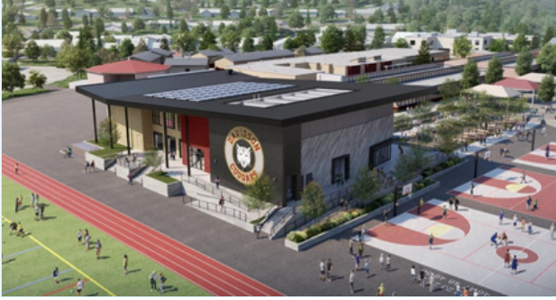
Davidson Middle School