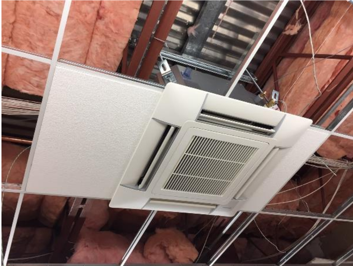
San Rafael High School HVAC Project