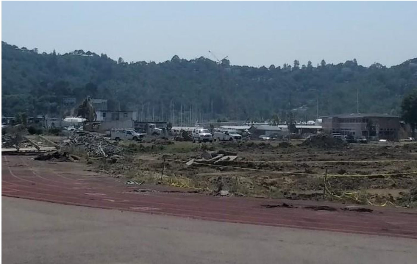
San Rafael High School Demolition