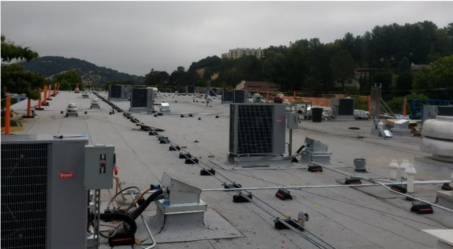
Terra Linda HVAC Project