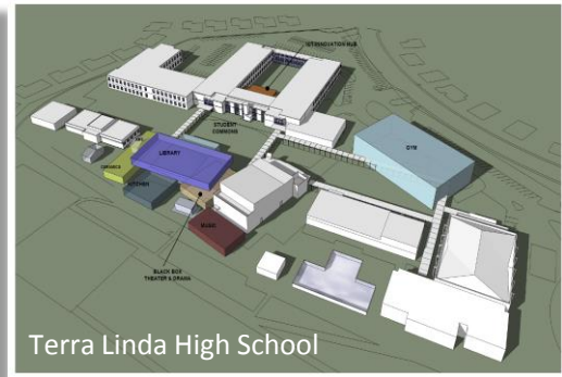
Terra Linda High School