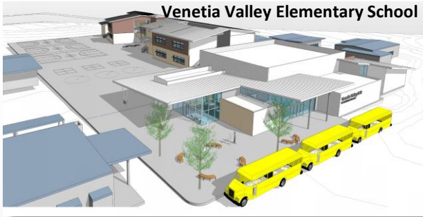
Venetia Valley Elementary School