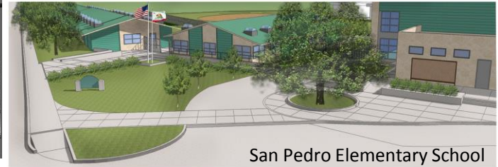
San Pedro Elementary School