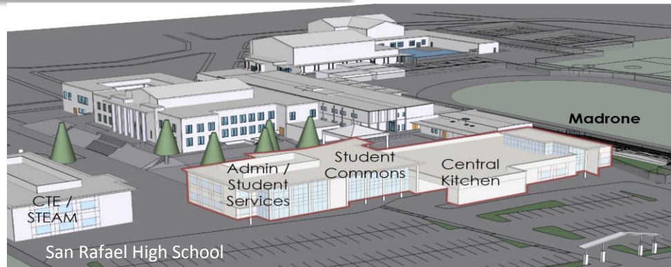
San Rafael High School