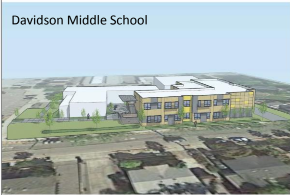
Davidson Middle School