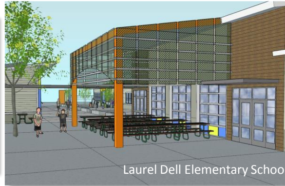
Laurel Dell Elementary School